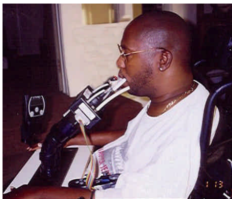
Using the controller

Adaptor cables are available for the X Box®, Game Cube® and personal computers for the analogue joystick.